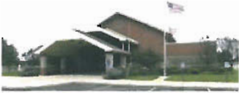
New Lebanon Courthouse

MONTGOMERY COUNTY MUNICIPAL COURT EASTERN DIVISION 2017 MAR 27 AM 9:59